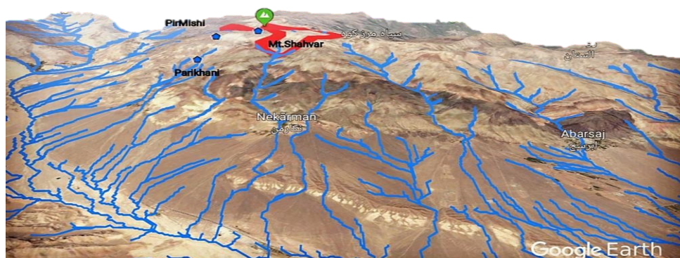
Fig 4. Bastam watershed area- shahroud and its gully and river system

slope basins can be expected. Another influential parameter is the vegetation. There are unique varieties in shahvar region. Onobrychis cornuta and juniperus in the area which grow in steep slopes have an important role in stabilization of the soil and controlling the floods.