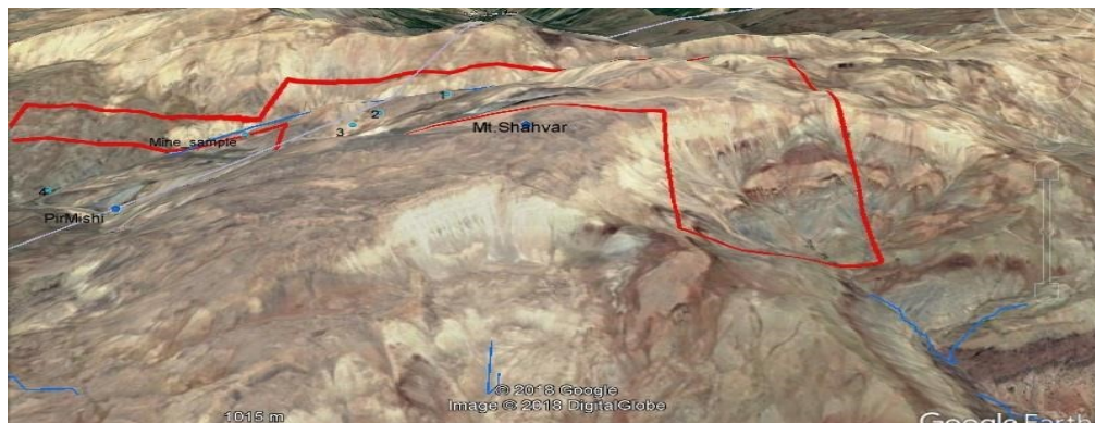
Fig 3. Aerial picture of the bauxite mine of Tash